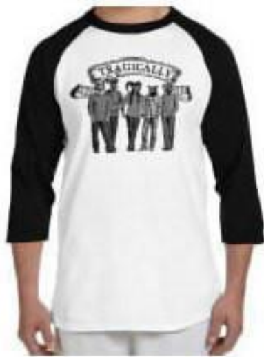
WHITE/BLACK UNISEX S-2XL