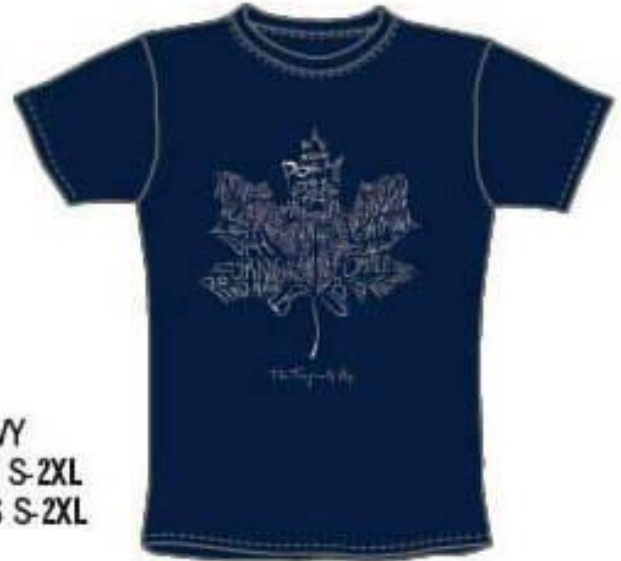
NAVY MEN'S S-2XL LADIES S-2XL